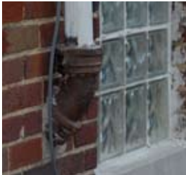
Bell Shape Pipe